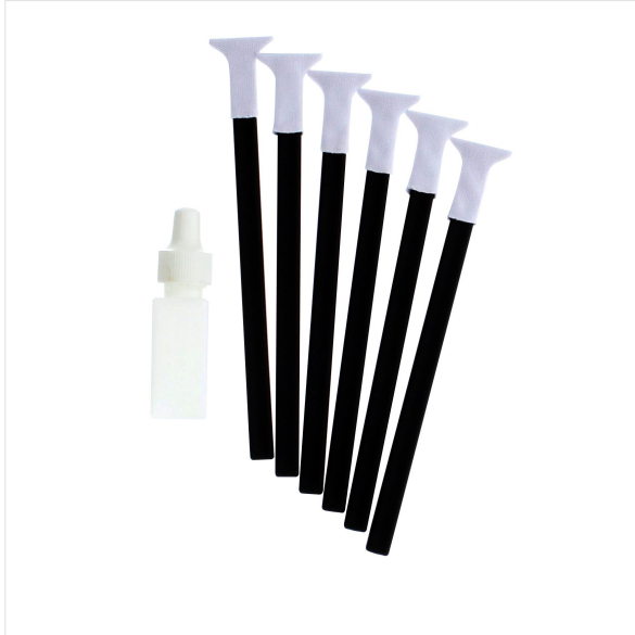
Image - Photo accessories - Camera cleaning

Pack of 6 swabs which measure 16mm and 3.6 ml bottle of cleaning solution in a handy spray format. Clean all the greasy stains and dry marks Compatible with CCD and CMOS sensors.