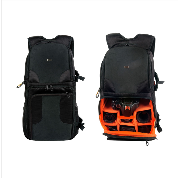
Image - Photo accessories - Camera bags